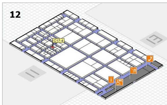
Hall 12 C17-4 Cortec Corporation

Encl: Interpack Site Plan USA Pavilion floor plan